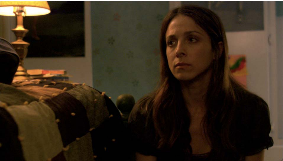
Rebecca (Marin Hinkle) in "Cough Drop"